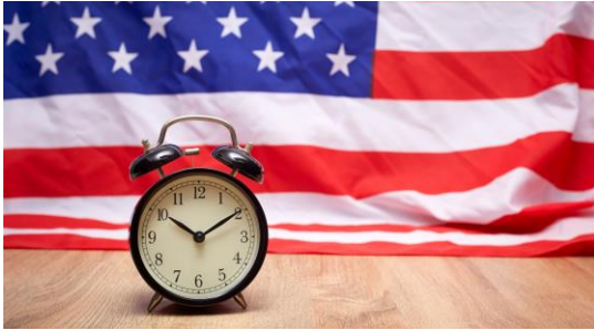
All deadlines are from www.myvote.wi.gov on July 6.