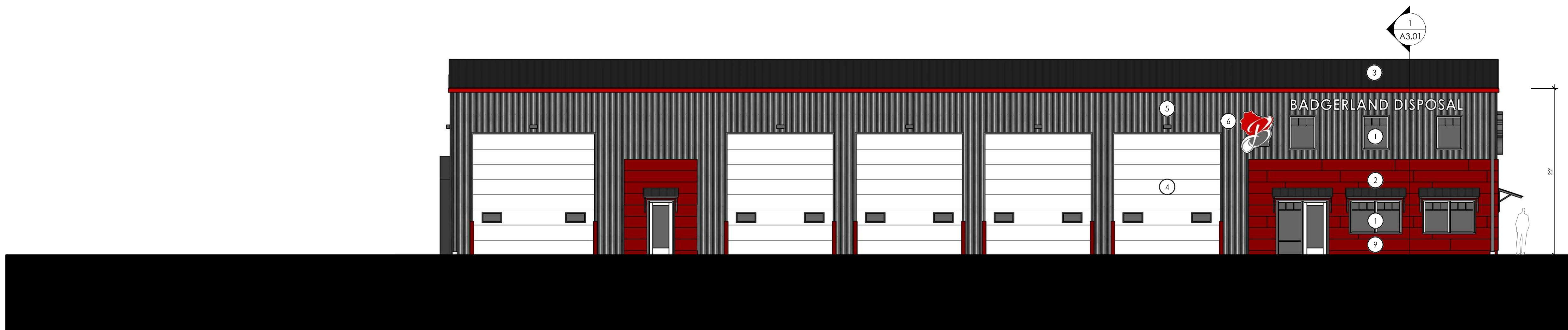
WEST ELEVATION 1/8" = 1'-0"