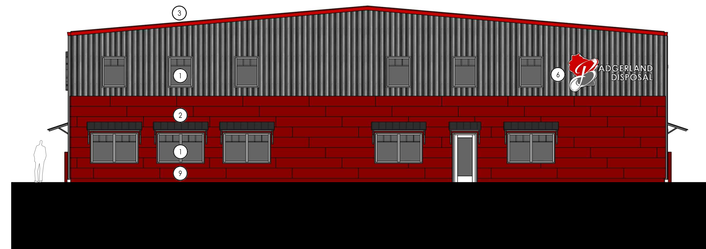
SOUTH ELEVATION 1/8" = 1'-0"