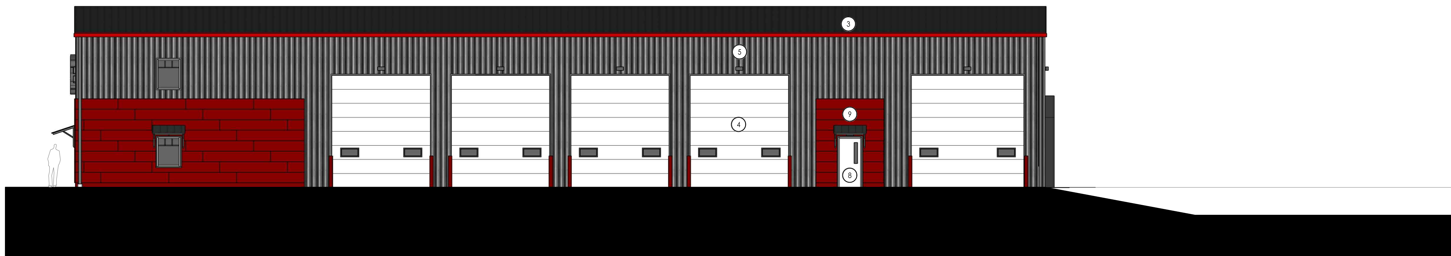
EAST ELEVATION 1/8" = 1'-0"